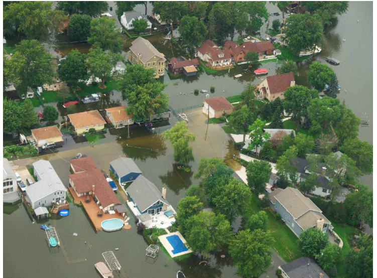
August, 2007 flooding in Fox Lake, Illinois

In 2006, the SMC Board adopted a Flood Response Manual that utilizes the National Weather Service's (NWS) watches and warnings system, and is colored coded to match the U.S. Department of Homeland Security's (DHS) color-coded alert system as shown on the following page. It also assigns key staff positions within SMC's own Emergency Operations Center (EOC) based on DHS' National Incident Management System (NIMS). For instance, if NWS issues a "Flood Watch" it corresponds to the manual's "Green Alert" level. At this level, SMC's key staff come together to, among other things, begin distributing email alerts to agency partners on SMC's activities, begin field deployments to known flood problem areas, and respond to media inquiries.