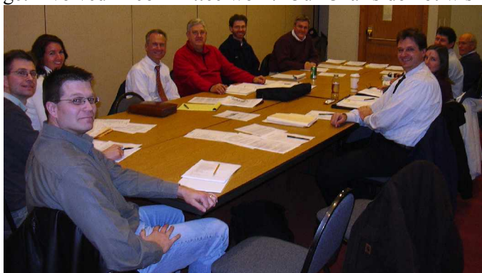
The January 2008 IAFSM Board Meeting. Please join us at our next meeting during the conference!