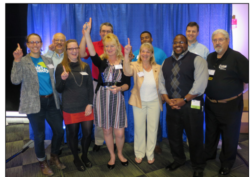
Representatives from Floodlothian Midlothian accept the Public Education and Outreach Award.