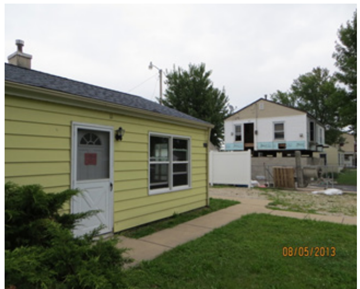
A red-tagged home and a home being elevated in Carbon Cliff after flooding in 2013.