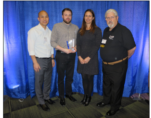
Loyola University accepts the Stormwater Management Master Plan award.